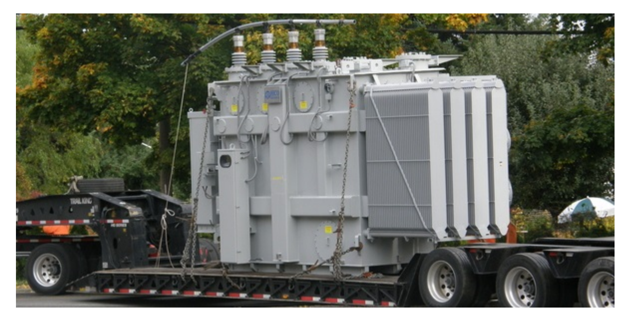
Transformer similar to the one required at the Murden Cove substation.