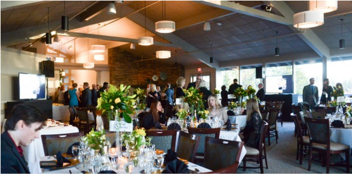
Annual BI Chamber of Commerce 2018 annual dinner