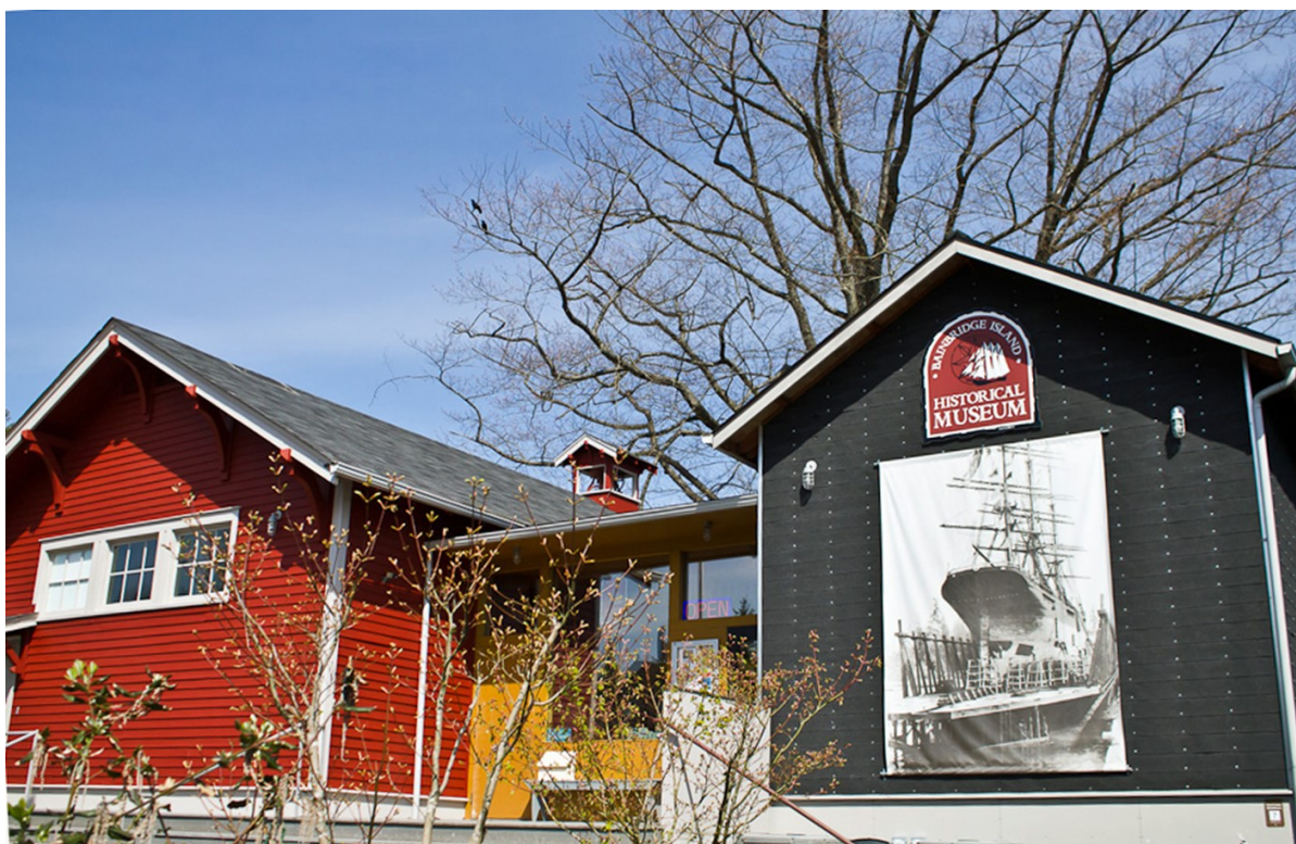
Pictured: The Bainbridge Island Historical Museum

Read the Bainbridge Island Review's recap of the session. The session was recorded and is available here . Please join us in continuing this important conversation and share the resources with youth who may need support. Thanks for the work you do, Raising Resilience!