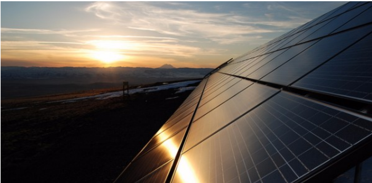
Solar array in Washington.

Nearby residents will be notified via mail several weeks before construction begins on each project. To learn more about these projects or previous system improvement projects, you can visit our current projects page and completed projects page on the PSE Bainbridge website.