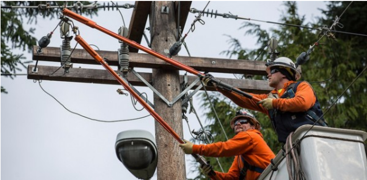
Crews conducting restoration work on the Island.

If you are interested in hearing more from the City on their electric utility plans, or would like to express your opinion on their efforts, you can always attend a council meeting (external link) to speak during the public comment period. If you have comments or questions regarding this issue, please contact us at info@psebainbridge.com or toll-free at 1-888-878-8632 .