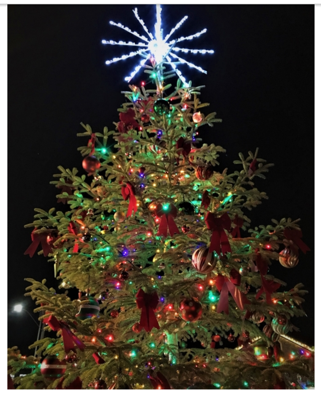
Pictured: The Bainbridge Downtown Association's holiday tree