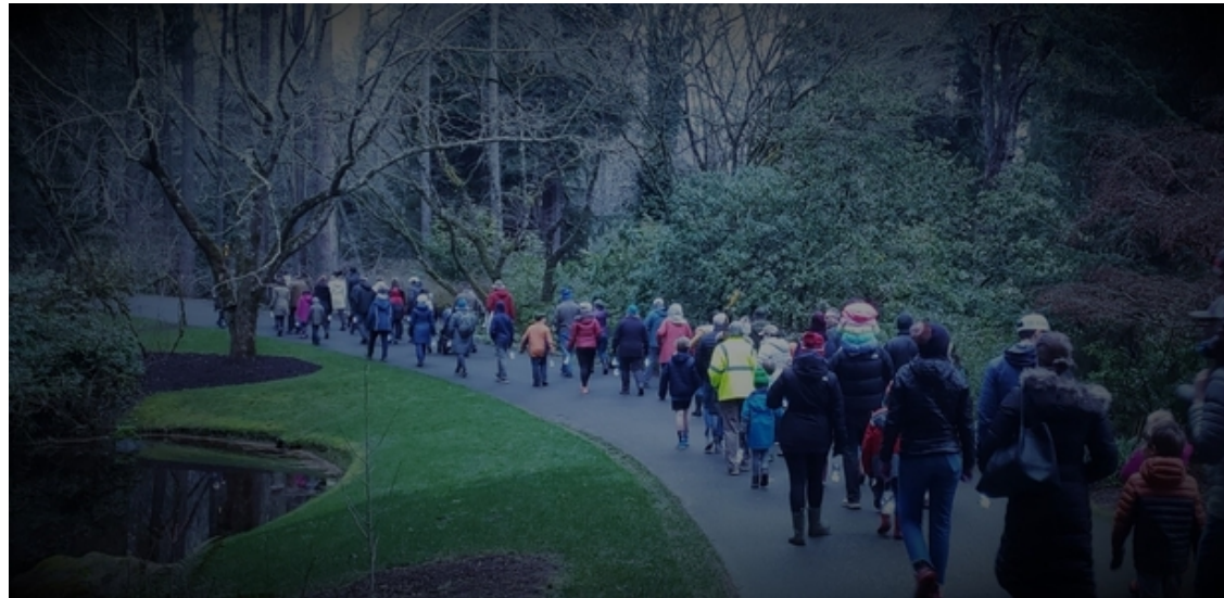
Pictured: Attendees at the Solstice Walks event held on January 11.

Safety first. Never touch or go within 35 feet of downed power lines because they might be energized. Call PSE at 1-888-225-5773 or call 911 to report problems.