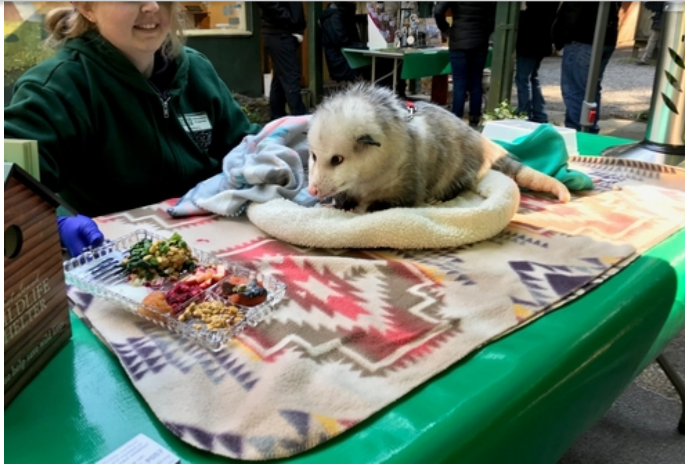
Pictured: Opal, a Virginia Possum & Education Ambassador for West Sound Wildlife Shelter (WSWS). WSWS was selected as a Powerful Partner in 2017 and 2019.