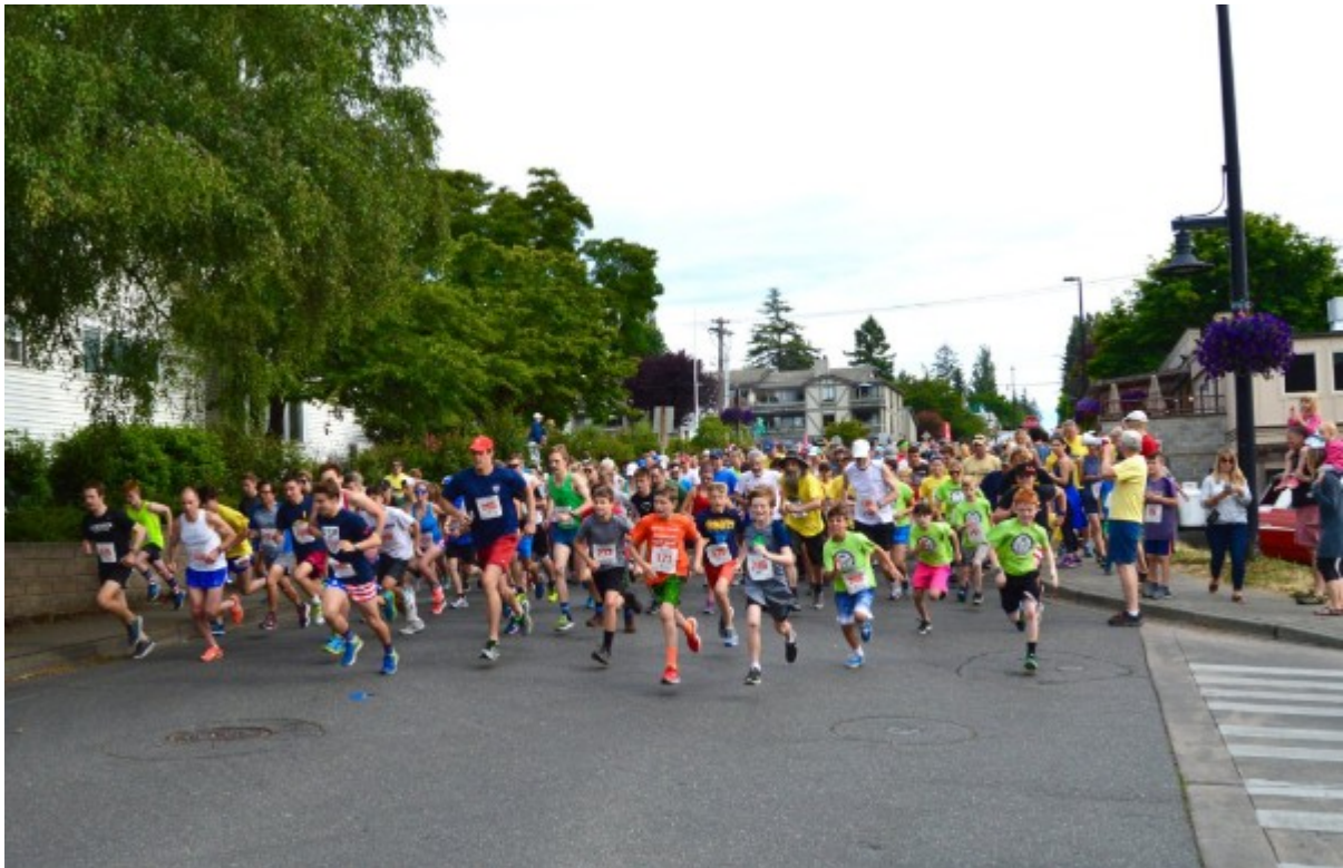
Participants enjoying the Kids Dash at 2018 BYS Fun Run.

PSE is proud to sponsor this fun event while providing reliable power solutions to keep Bainbridge dancing!