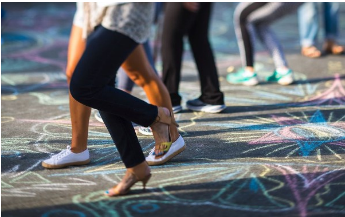
Revelers dance in the street amid a backdrop of chalk illustrations.

PSE is proud to join other Platinum level sponsors Bainbridge Island Ace Hardware, Dubious Family Foundation, Eileen Black, and Modern Collision in supporting this incredible event.