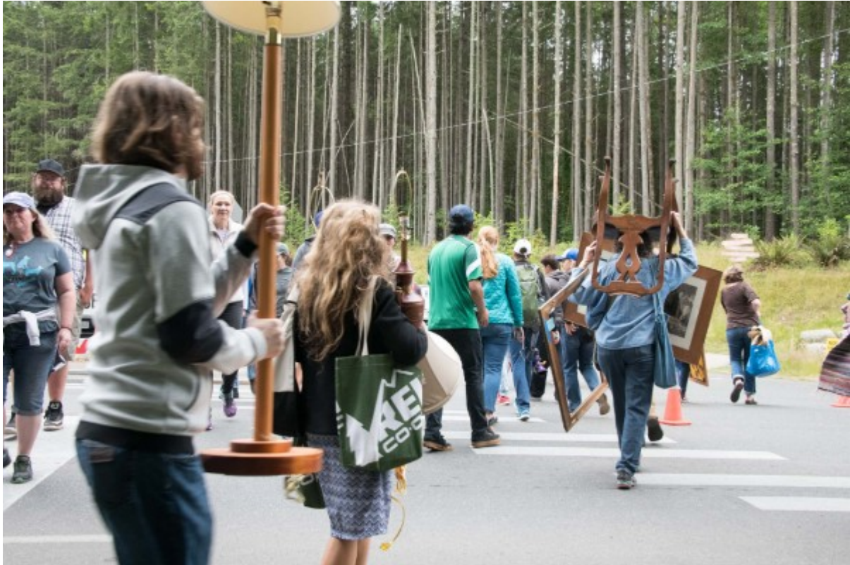
Happy shoppers leaving with purchased treasures from 2018 Rotary Auction.