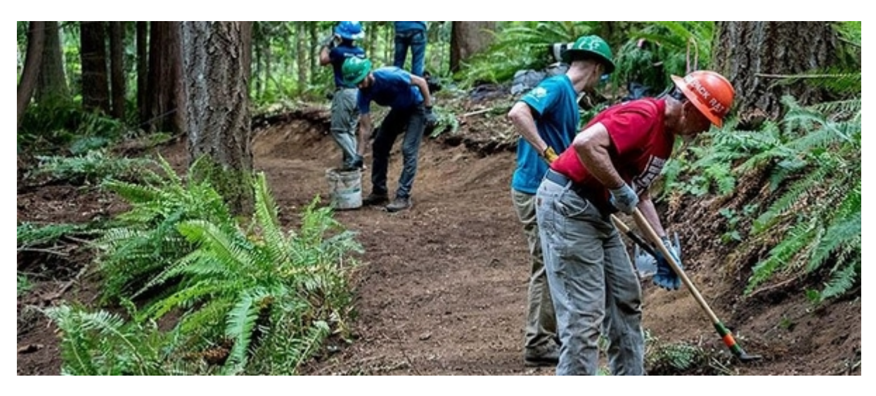
TeamPSE staff volunteering to maintain Washington trails.