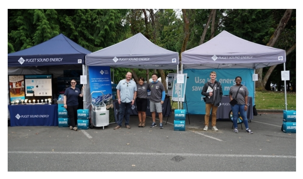
PSE staff ready to talk to you and answer your questions!

PSE is proud to sponsor this event and we look forward to continuing to provide volunteer resources for many years to come!