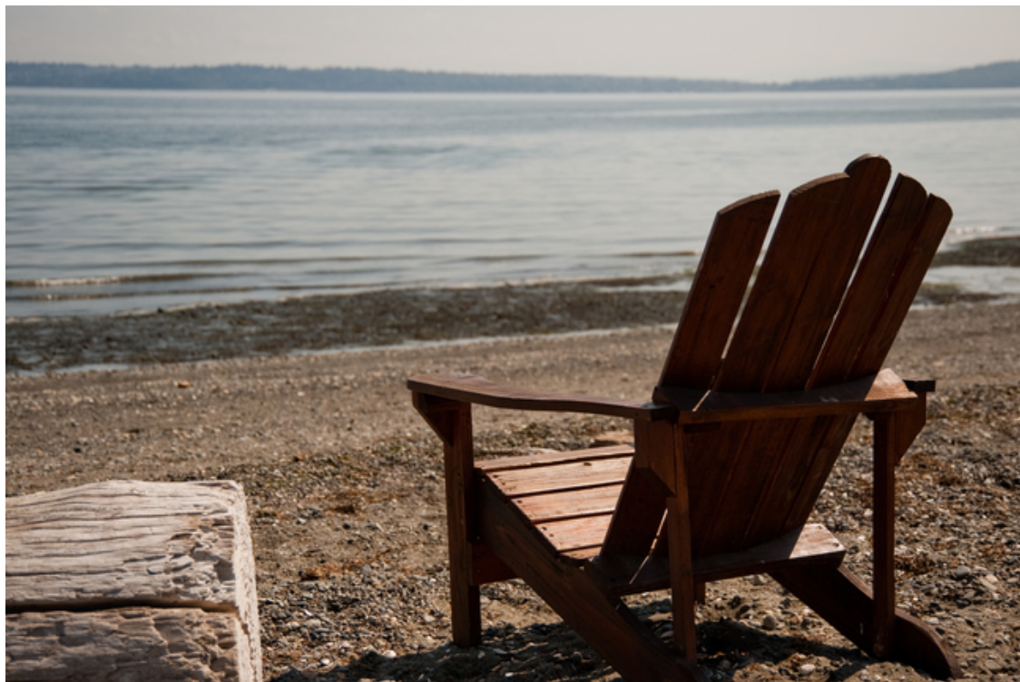
Pictured: Adirondack chair on Bainbridge Island beach

This month, we're updating you on projects occurring on the island and the ongoing community engagement process for the "missing link" transmission line. We're also sharing news about two organizations we are proudly sponsoring this year. Thanks for reading!