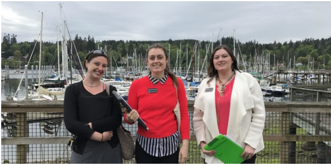
Renewable Team members at the marina in Winslow.