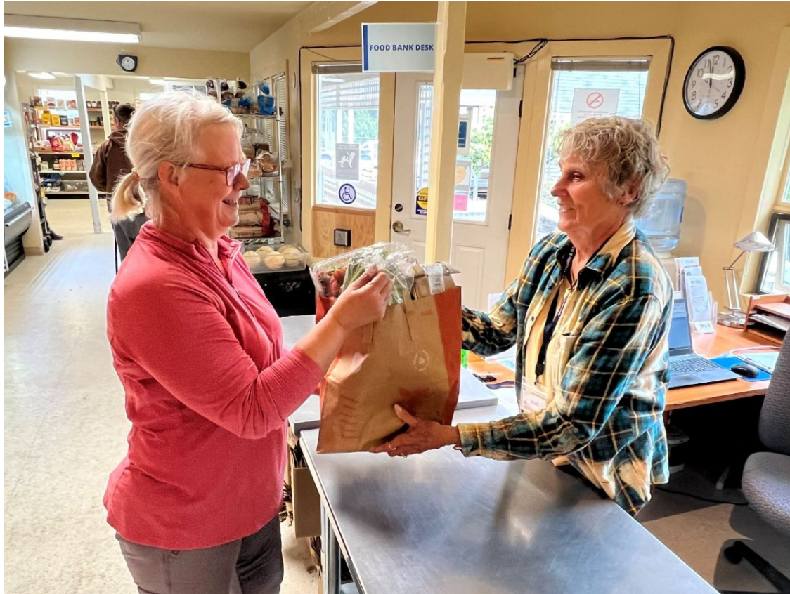
Distributing food to people in need.