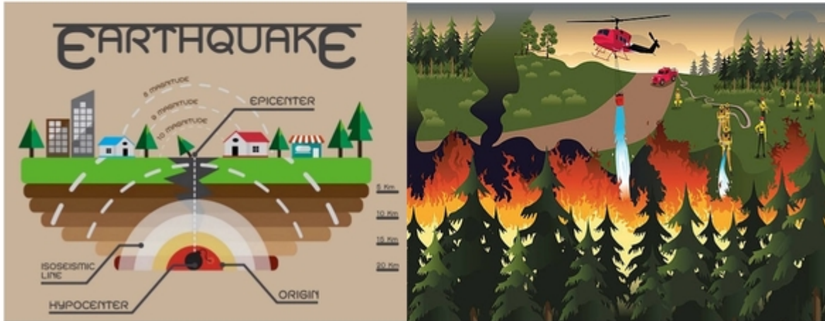
Poster for the 2018 3 Days of Preparedness