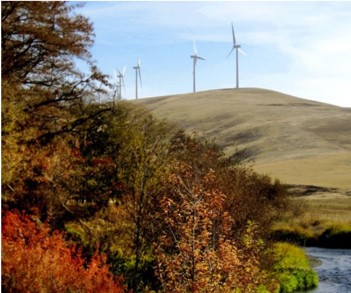
Fall colors at Hopkins Ridge wind facility.