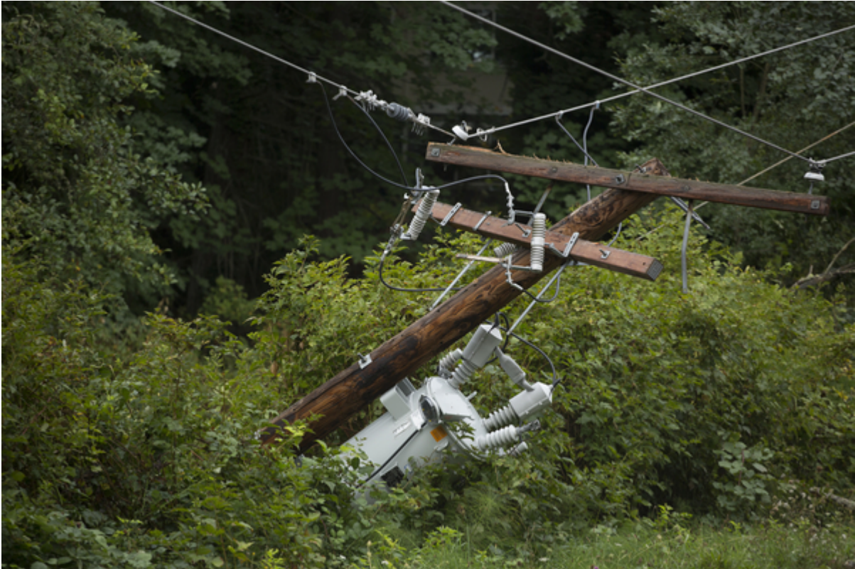
Pole and transformer down during 2016 storm on Bainbridge Island.

Day three gives you access to Bainbridge Island’s system of neighborhood gathering sites for emergencies. Put your knowledge into practice and join your community to take the tour!