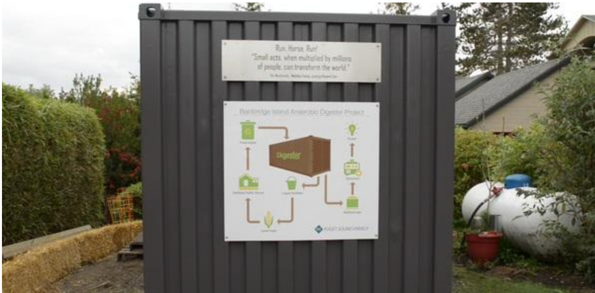
The HORSE digester was located at the Harbour Public House this past year.

If you or your group would like to meet with us to discuss power issues within your community, please contact us at info@psebainbridge.com or 1-888-878-8632 to schedule a meeting.