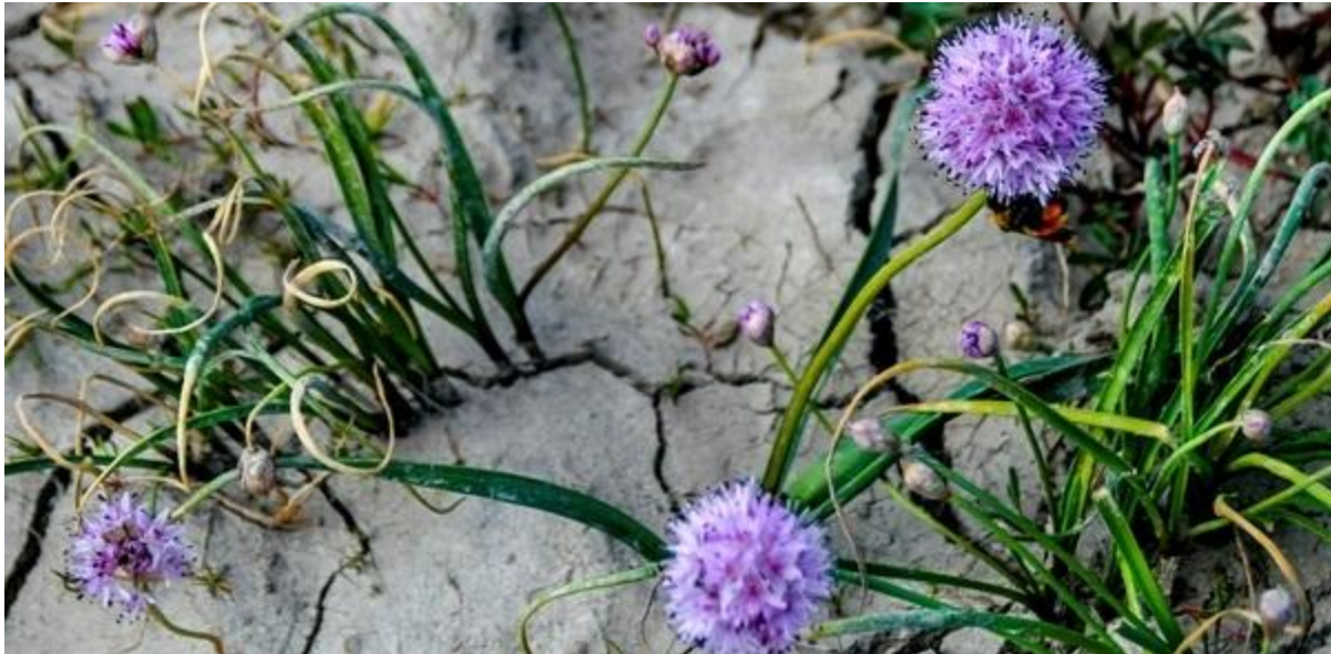
Wildflowers at the Wild Horse Wind & Solar Facility.

As summer winds down and we begin to prepare for fall, read on to learn about upcoming opportunities to meet with PSE staff about the Island's energy future, prepare for storm season and more.