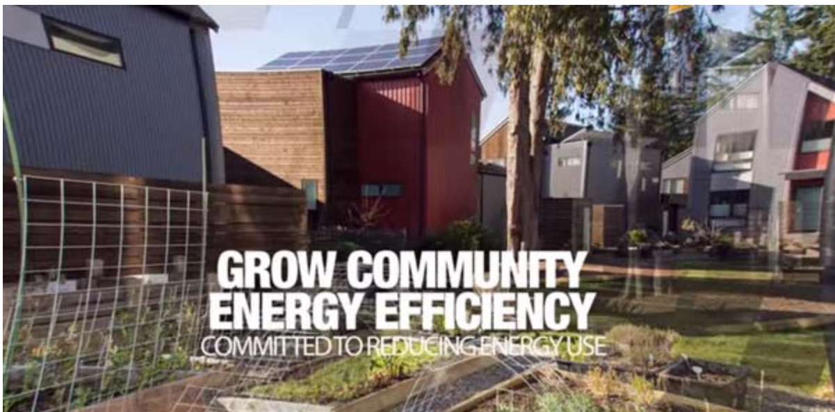
Part of the short video PSE shared before Movies in the Park this summer.

Regardless of where this HORSE ends up, PSE is working with the City to explore the potential of a larger, permanent community digester and will keep the community updated.