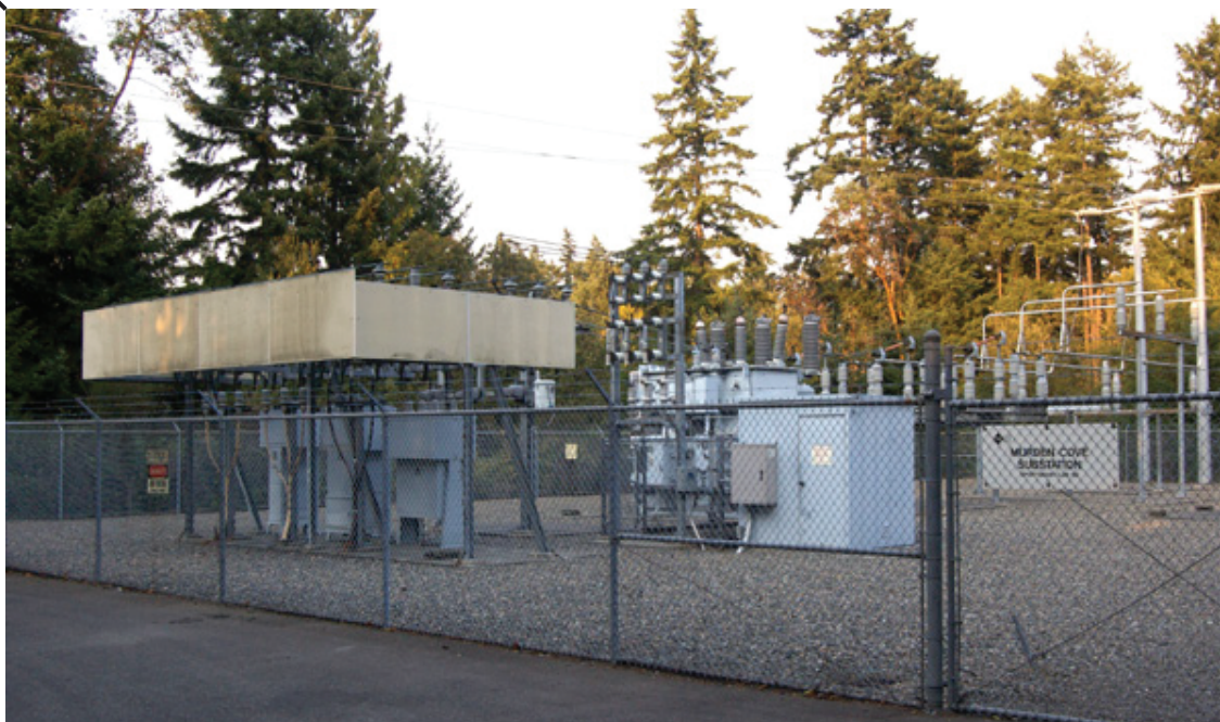
Murden Cove substation Serving approximately 4,850 customers Originally built in 1979