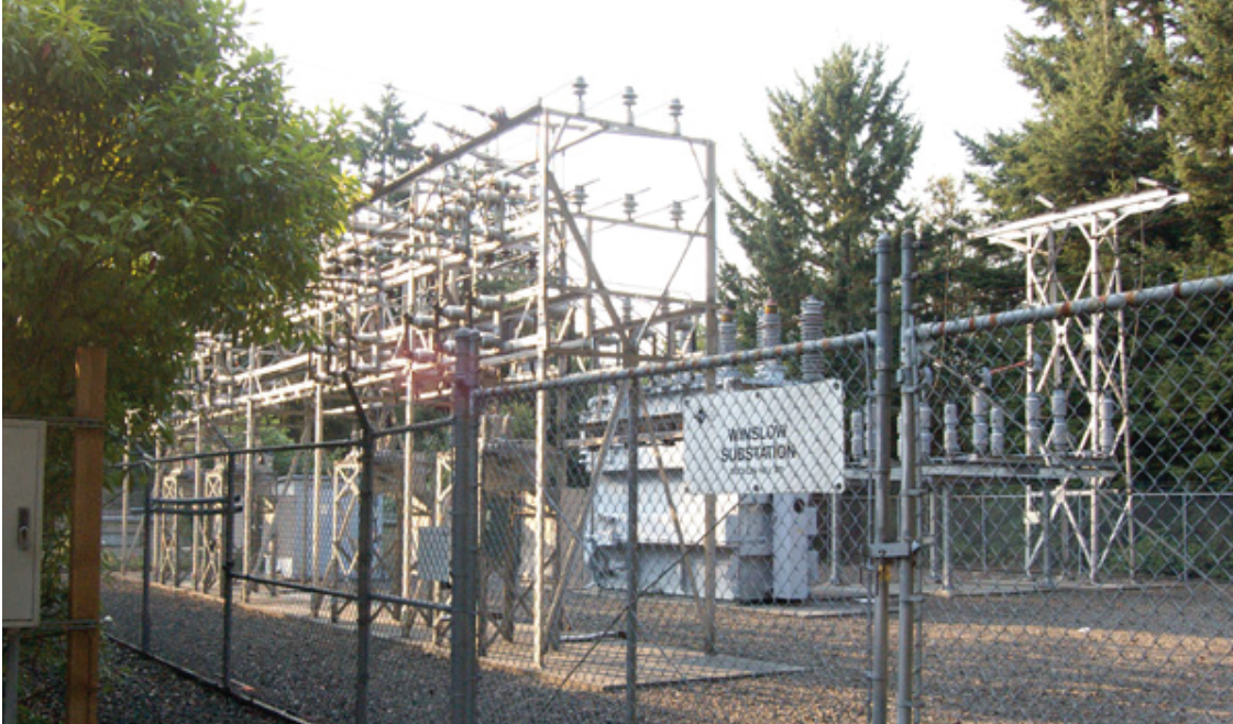
Winslow substation Serving approximately 3,980 customers Originally built in 1960