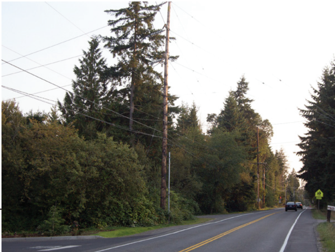
Transmission lines on Sportsman Club Road supplying power to Murden Cove substation