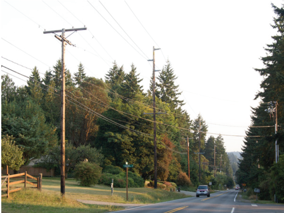
Transmission lines above distribution lines on Madison Avenue NE