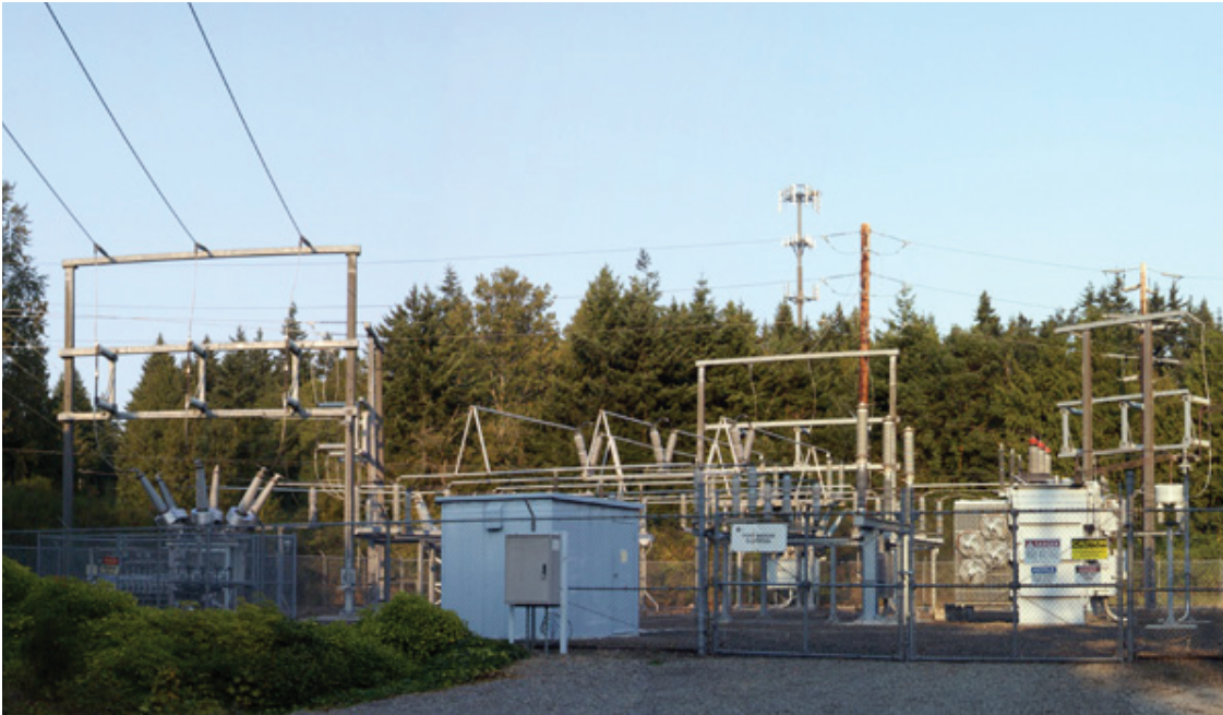
Port Madison substation Serving approximately 4,140 customers Originally built in 1954 New transmission line and improvements in 2000