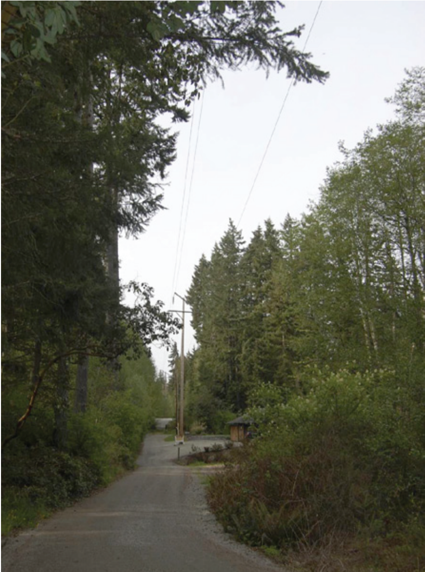
Transmission lines on Carmella Lane supplying power to Winslow substation