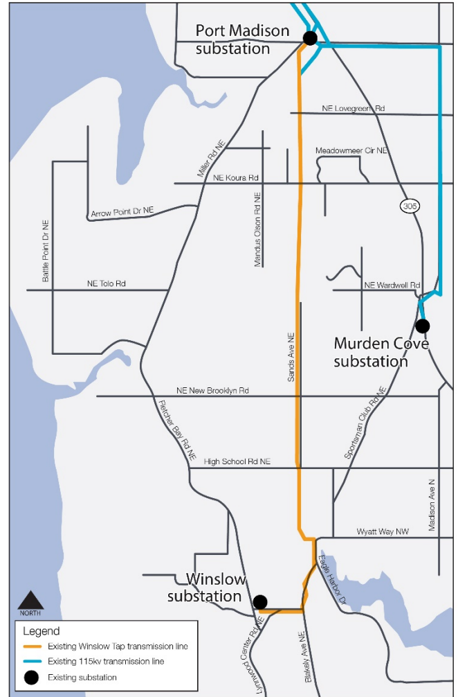
Winslow Tap 115 kV transmission line Bainbridge Island