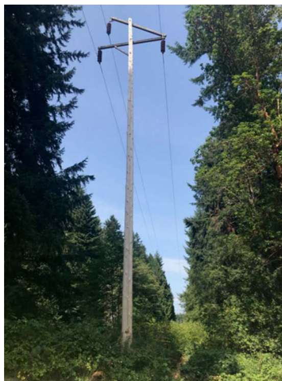
Pictured: The existing Winslow Tap corridor, which has 1960-era equipment nearing the end of its useful life that needs to be replaced